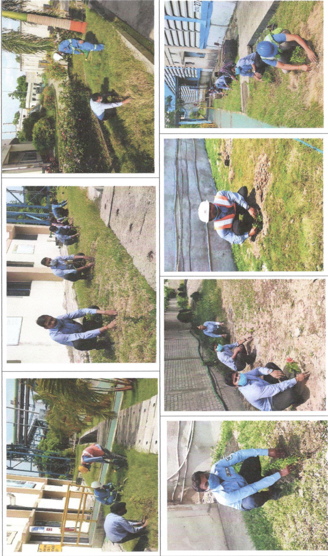
Plantation inside the Plant Premises