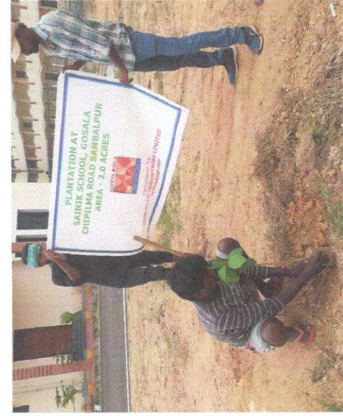
Plantation in Sainik School, Gosala Chipilma Road Sambalpur