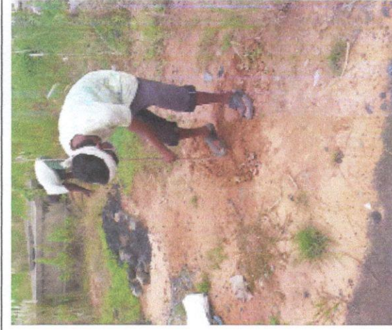
Plantation in Sainik School, Gosala Chipilma Road Sambalpur