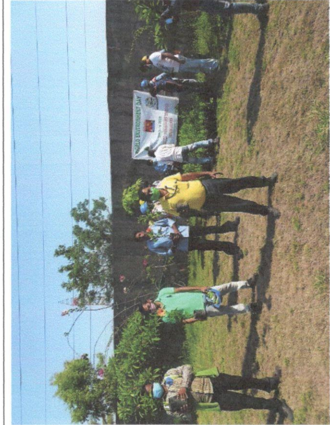
Free Seedling Distribution