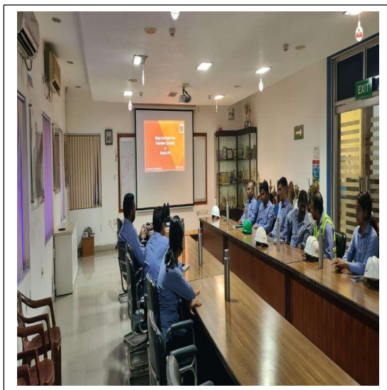
Awareness among employees