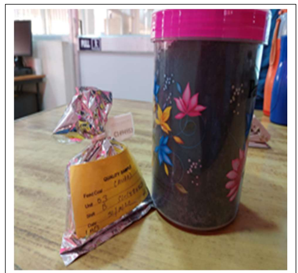
Use of aluminium foil pouch in coal sampling