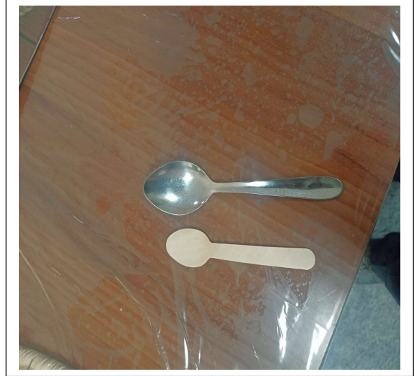
Use of wooden & steel spoons in GH