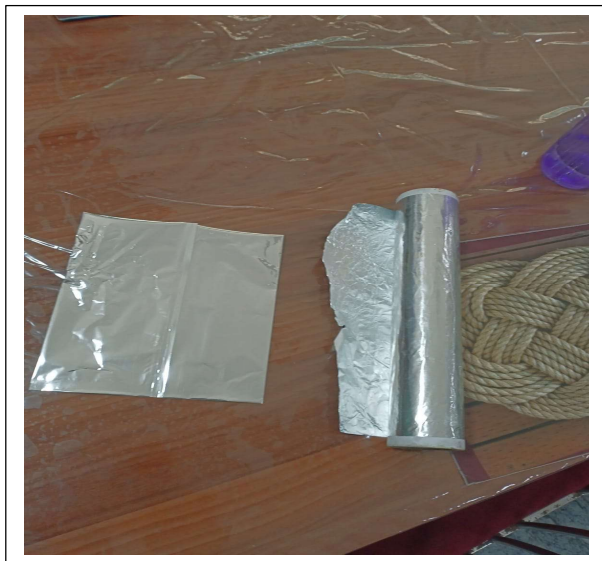
Use of wooden & steel spoons in GH