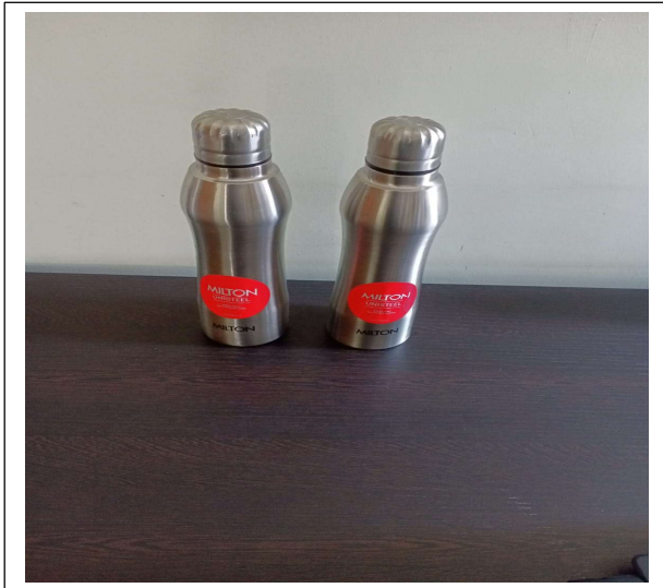
Use of Steel water bottles in GH, Conference Halls, etc.